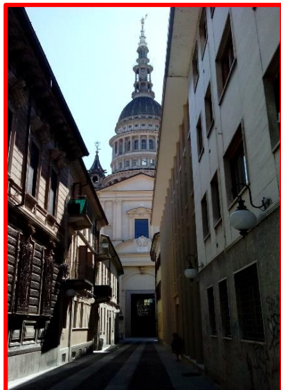
NOVARA, 5-6-7 October 2016 SCIENTIFIC and CULTURAL PROGRAM