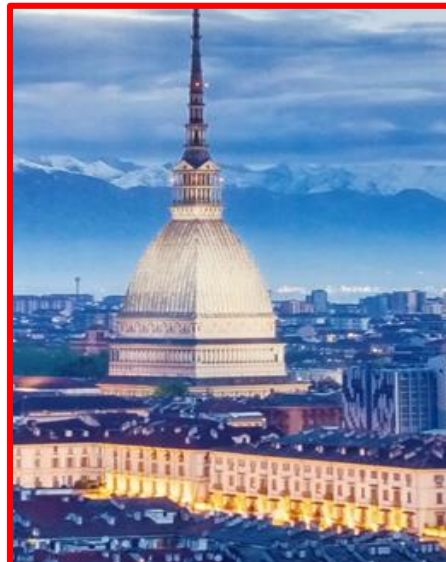
TORINO, 8 October 2016 SOCIAL EVENT and FAREWELL PARTY