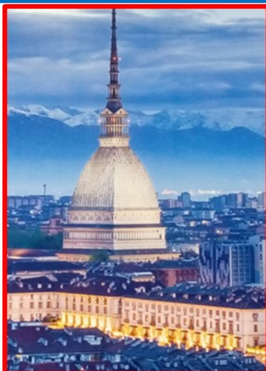
TORINO, 8 October 2016 SOCIAL EVENT and FAREWELL PARTY