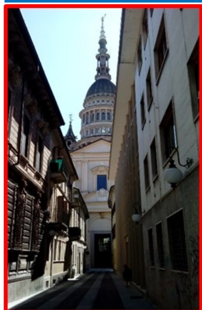
NOVARA, 5-6-7 October 2016 SCIENTIFIC and CULTURAL PROGRAM

Skin cancer, brain cancer, breast cancer, mesothelioma, hemato-oncology, ovary cancer, prostate cancer, colon cancer, cholangiocarcinoma.